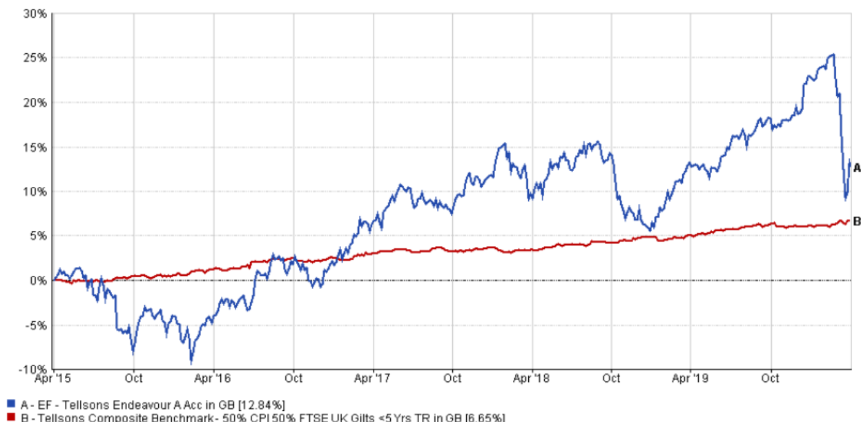
Pricing Spread: Bid-Bid • Data Frequency: Daily • Currency: Pounds Sterling

01/04/2015 - 31/03/2020 Data from FE fundinfo2020